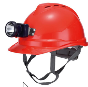
Available with LED Light