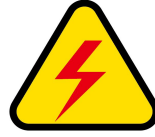
Electric Hazard 18KV