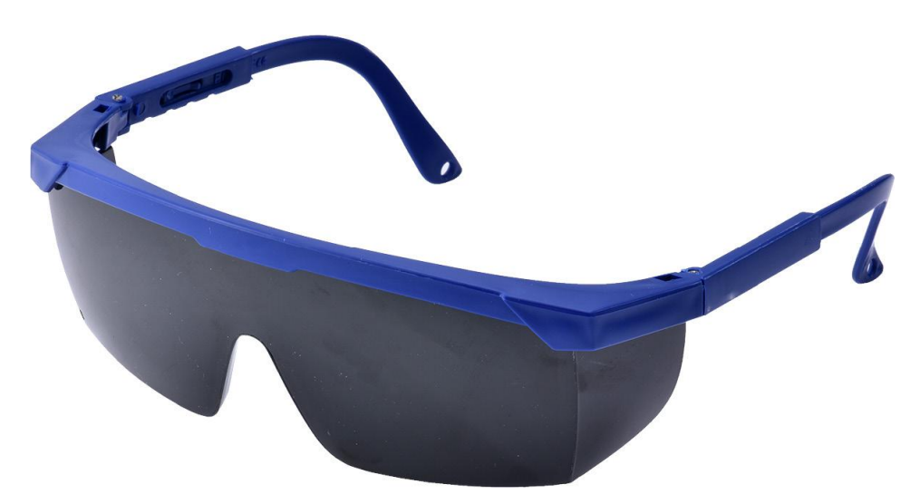
& Sand Ant ention